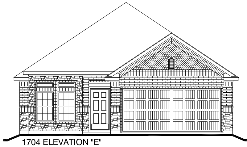
1704 ELEVATION "E"